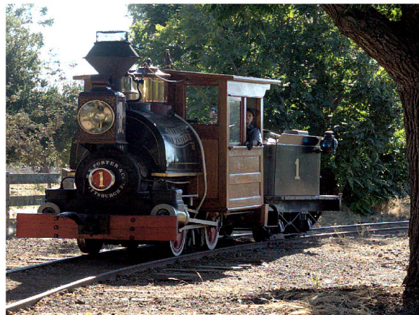
1889 Tank Porter Engine 'Antelope & Western #1'