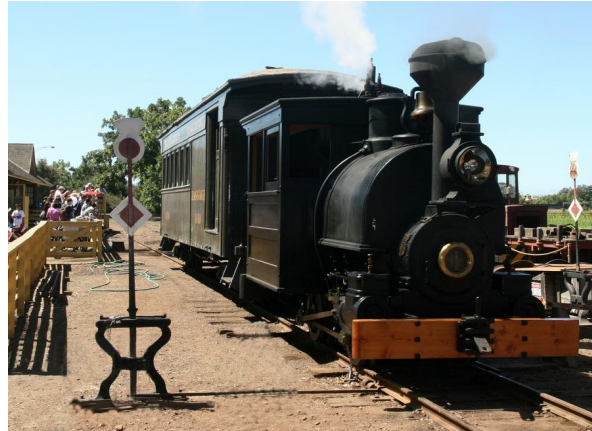
1890 Tank Porter Engine 'Cortez Mining Co #1'