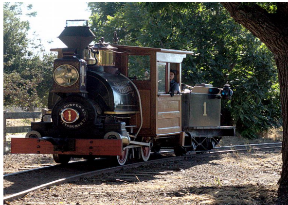
1889 Tank Porter Engine 'Antelope & Western #1'