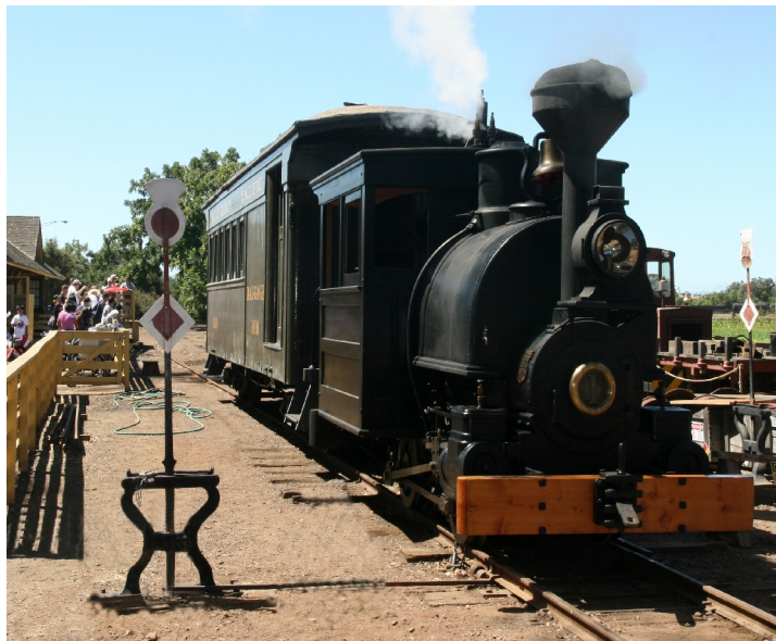
1890 Tank Porter Engine 'Cortez Mining Co #1' 'Ann Marie'

Patterson House Tours Farmyard Farm Animals Blacksmithing Country Kitchen Organic Farming Farm Equipment Picnicking