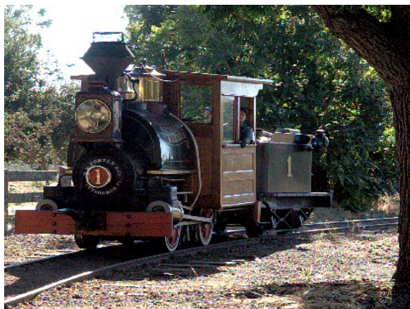
1889 Tank Porter Engine 'Antelope & Western #1'