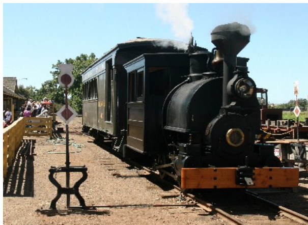
1890 Tank Porter Engine 'Cortez Mining Co #1'

Patterson House Tours Farmyard Farm Animals Blacksmithing Country Kitchen Organic Farming Farm Equipment Picnicking